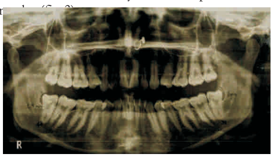
Fig1 Orthopantograph showing follicular width of 2mm in 38

In this case, odontogenic keratocyst was diagnosed based on the presence of a cyst like lesion lined by parakeratinized stratified squamous epithelium. The basal cell layer showed tomb stone like appearance This odontogenic keratocyst like changes in the follicular epithelium was confirmed by immunohistochemistry KI67- a proliferation